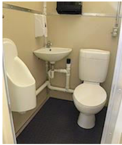
Waterless Urinal Option