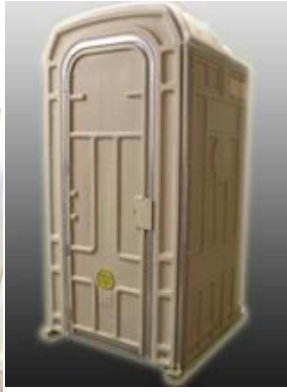
SJSDCSS 520 Comfort Station